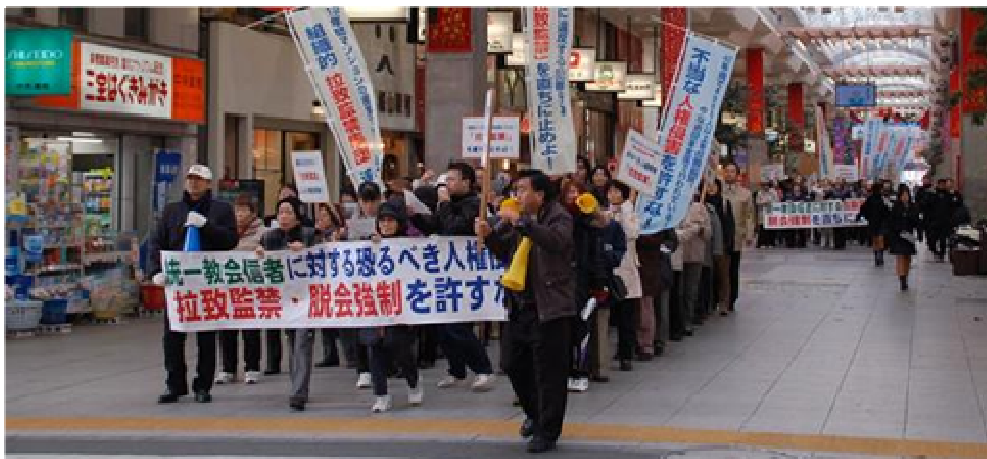
Religious freedom march Ehime Prefecture. Protests were reported in every prefecture of Japan, 21,000 participating nationwide.