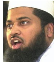
Imam Shuaib ub-Din Utah Islamic Center