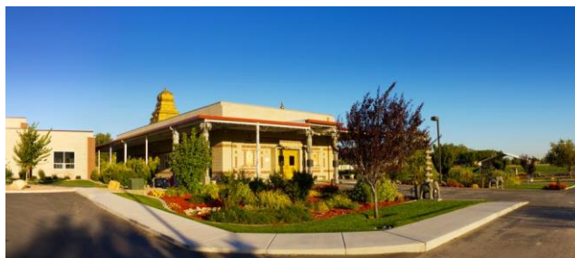
Sri Ganseha Hindu Temple